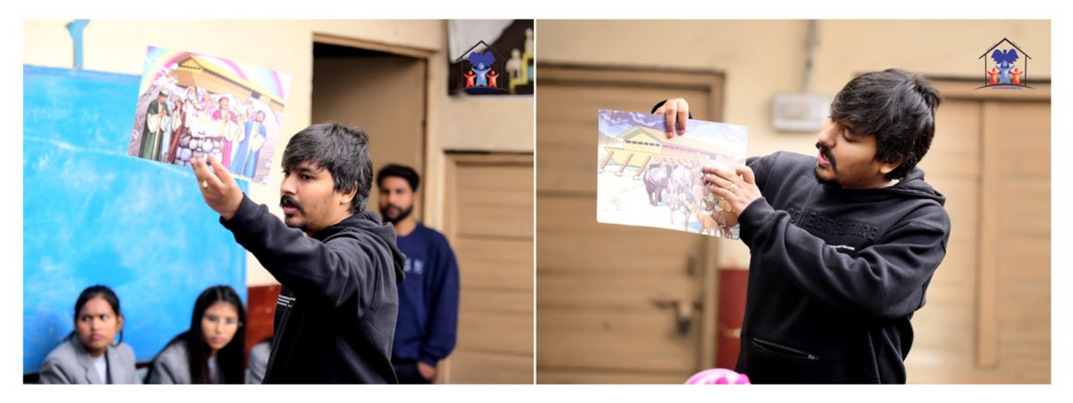
"I can do all things in Him who strengthens me" (Philippians 4:13)